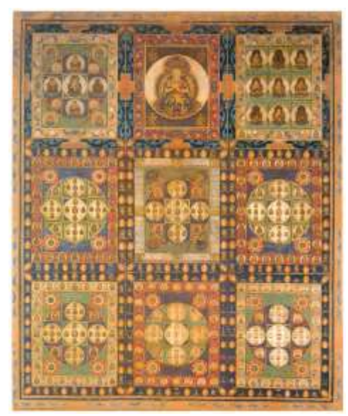
Vajra (Diamond, indestructible) Mandala

I remember one day visiting the Rochester Museum of Art, after a session the double nature. I suddenly came upon this pair of Japanese Buddhist tangkas of the Vajra and Womb mandalas. I was suddenly flashed by the realization that the "double nature" is a divine idea or deity itself, not a concept.